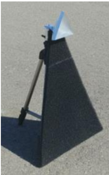
Trihedral Calibration Object