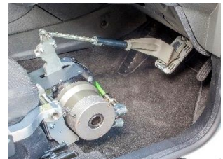
Rotary Brake Robot (RBR1500)