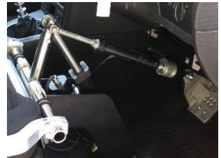
Brake Robot (BR1000)

A Brake Robot is used to apply accurate inputs to a vehicle's brake pedal for braking characterisation and handling behaviour measurement. It is typically used to apply step or ramped force or position inputs to the brake pedal. It can also be used to control vehicle deceleration or brake-line pressure with a suitable feedback transducer. The BR1000 can be combined with an AR1 to give control of a vehicle's speed. The BR1000 brake robot is the original model and is available in two configurations. The on-seat configuration is optimised to allow quick installation in a wide range of vehicles, while the under-seat configuration gives the most rigid installation and includes a racing bucket seat for the driver. It offers a reliable, high-performance actuator suitable for most brake testing.