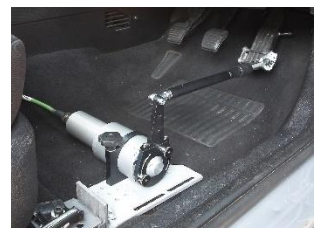
Accelerator Robot (AR)

The AR1 accelerator robot uses a compact rotary actuator to control throttle pedal position. Used on its own it can give accurate speed control for constant speed / acceleration, and it can be combined with a BR1000 to give full speed control (including deceleration). It can also be used for control of throttle pedal position.