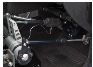
Clutch Robot (CR)

A Rotary Brake Robots use compact rotary actuators which provide a very high apply rate. The RBR1500 offers the highest performance of any AB Dynamics brake robot and is designed to give the combination of high force and rapid apply rate needed for Brake Assist System testing. The RBR600 uses the same actuator as a CBAR600 for moderate brake force testing.